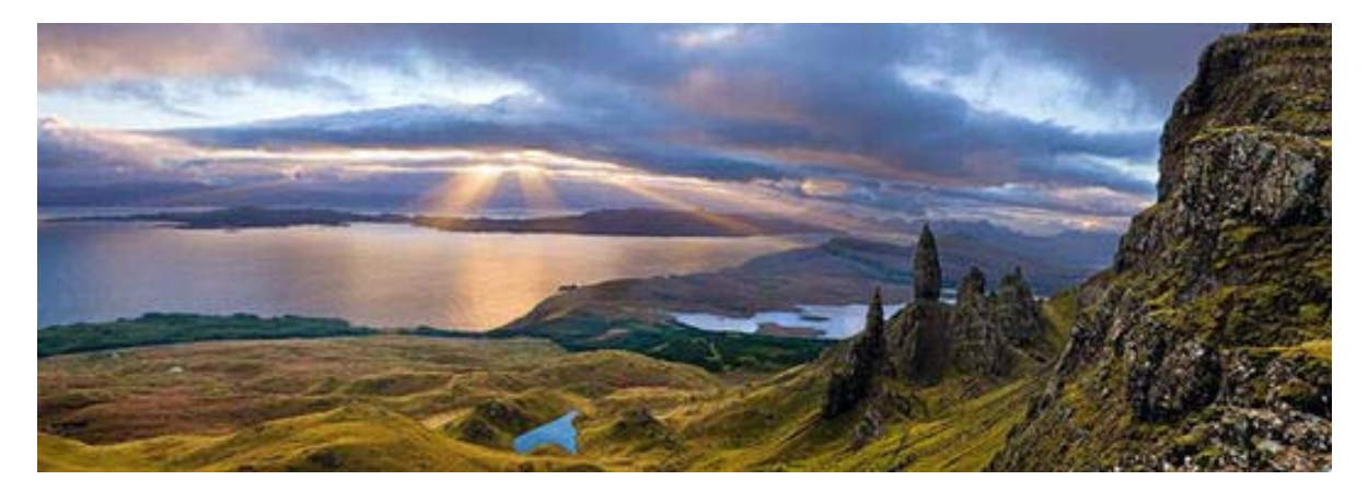
Looking down from the Storr, a rocky hill on the Trotternish peninsula of the Isle of Skye overlooking the Sound of Raasay.

If you are a member of one of the following clans McDonald, MacKinnon, MacNicol, Macleod or McQueen your ancestors may have lived on Skye and perhaps your relatives still do?