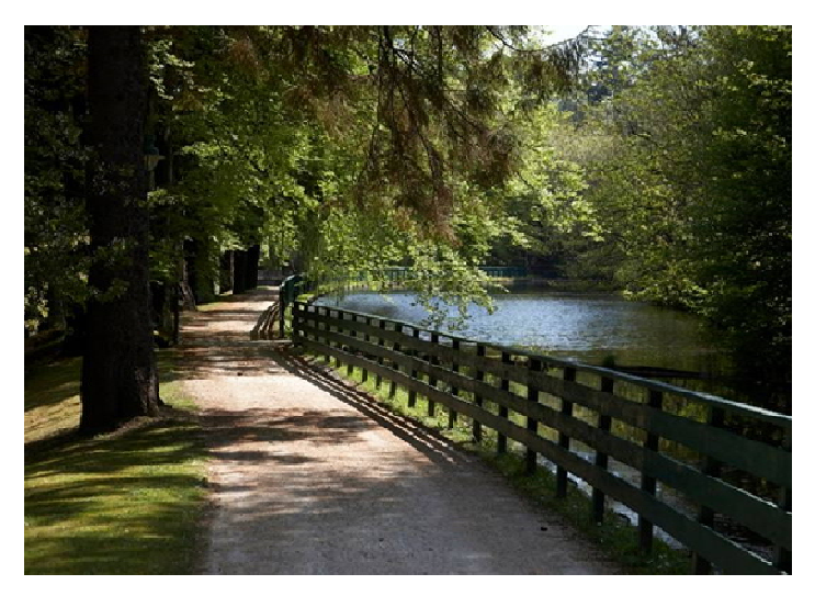
Speyside sojourn: Visitors on the Malt Whisky Trail can view Glen Grant's cooling pond