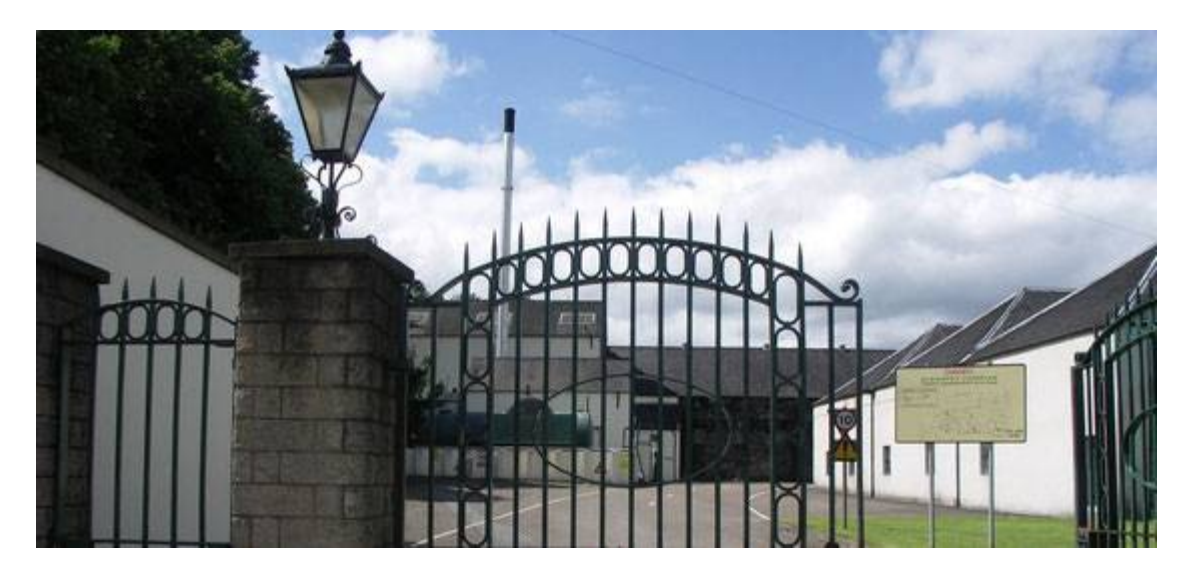
Glen Spey Distillery

Out-with the firm's 'Flora & Fauna' range it is very rarely seen as single malt, but can be found in bottles by independent bottlers.